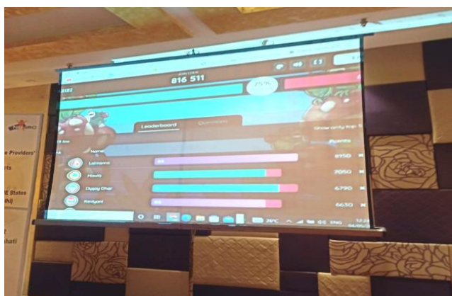
Online Dashboard for Quiz

In this session, all participants took online quiz program through an application called 'Quizizz' where they selected the correct answer on the MCQ's which were prepared based on the NQAS overview, AOC A & B, and small token of appreciation was given to the winners.