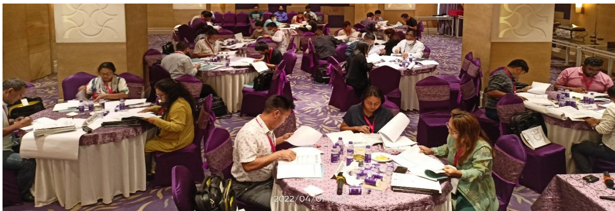
Post Training Evaluation

QPS, RRCNE Team has conducted a Post training evaluation test of one-hour duration for all the 30 participants with an objective type of questionnaire. There were three sets of question papers with total marks 40. The test is followed by providing feedback on the 3 days training program in the provided training feedback form.