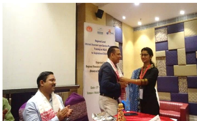
Felicitation of the respected dignitaries on the dais