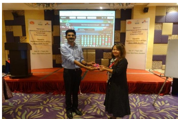
Gift Distribution to the Top Scorer